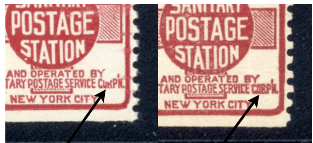
Broken "OR" in "CORP'N" Normal "OR"

This variety does not seem to be especially difficult to find as there have been at least two pairs offered on eBay since the article appeared in The United States Specialist . I am sure there were quite a few more prior to the publication of the article also. □