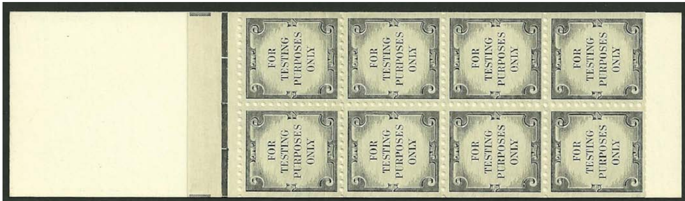
TDB47 Outside Covers (top) with “FRONT COVER” in Blue and Inside with Pane of 8. Note: The Illustration of the TDB47 Outside Cover is not inverted.