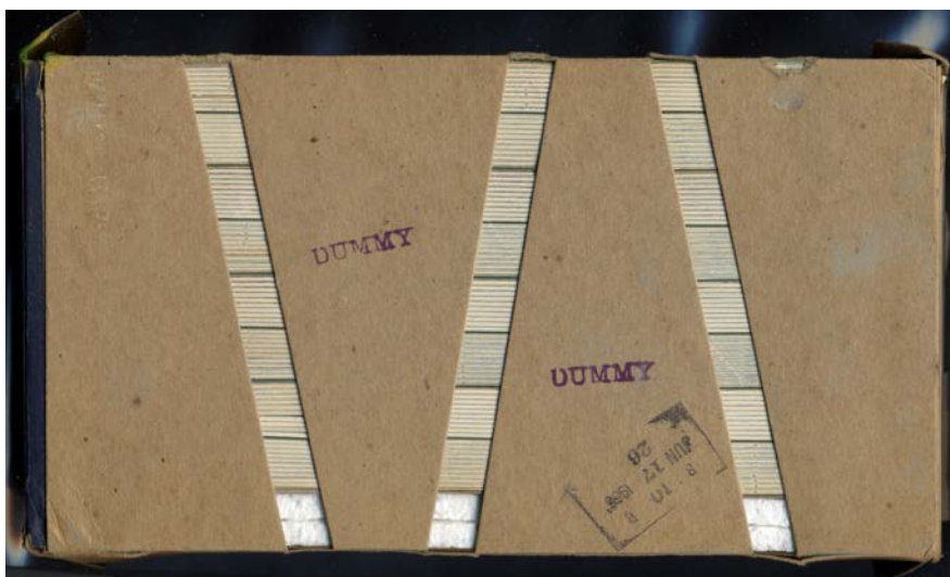
Photo of a full box of 240 - TDB12a Dummy Booklets Showing two red-violet "DUMMY" handstamps and black Inspector's handstamp B 10 B with a Jun 17, 1966 date, and 26 .